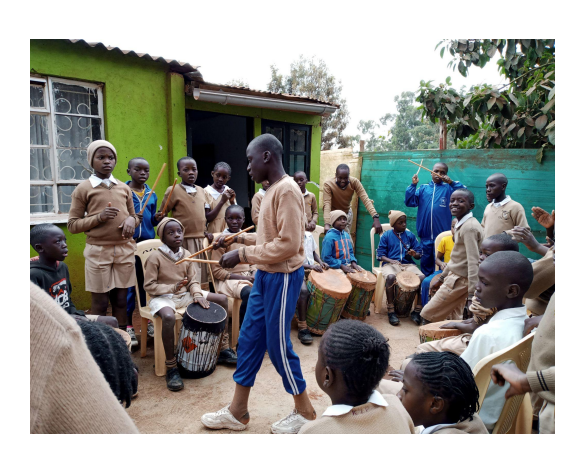
Music students learning the percussions drums