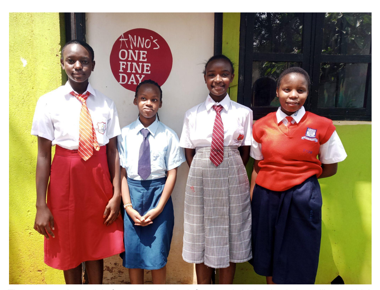
They were excited to join form 1 which is their first year in high school, they will attend high school for the next 4 years . They all passed their National Examinations and they have been very steady in their exams throughout the year .